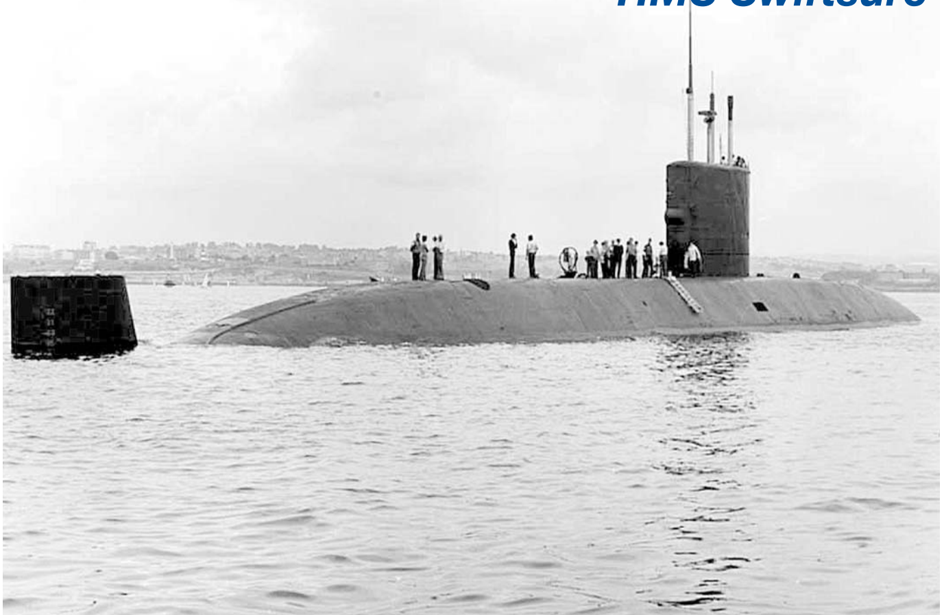
NEW CLASS: Swiftsure was launched at Barrow on September 7 in 1971 and commissioned in 1973

T HE nuclear-powered submarine Swiftsure was the first of class and was launched by Vickers at Barrow on September 7 in 1971.