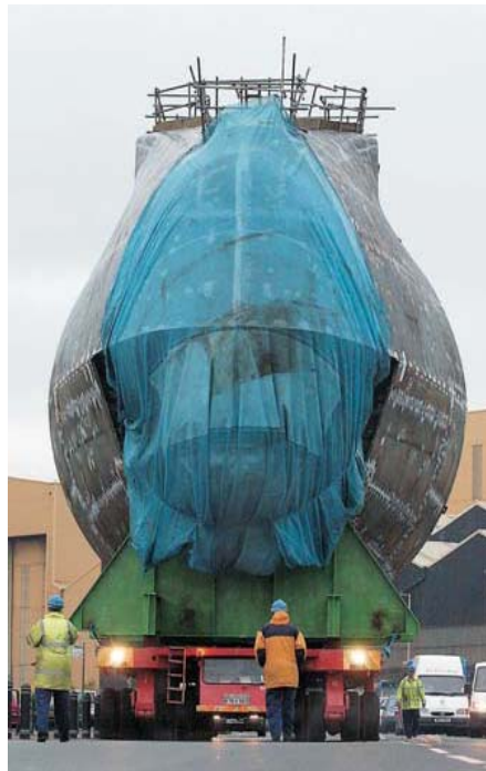
ON THE MOVE: A giant section of the Astute submarine being taken along Bridge Road, Barrow

Originally, 46 submarines were ordered, but only 18 were launched (10 by Vickers at Barrow) and 16 were commissioned, the other two hulls being used for crush testing.