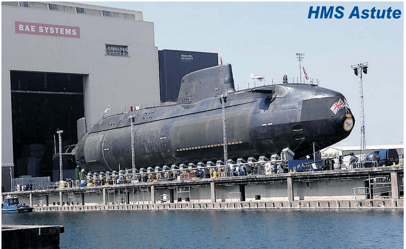
NEW ERA: Britain's first new "super-sub" Astute was launched by the Duchess of Cornwall on June 8 in 2007

IT must be quite a rarity for a shipyard to have launched two submarines with the same name.