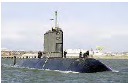
Upholder class sub in Barrow

Since 1910 Canada has put more than 850 warships to sea under the naval ensign.