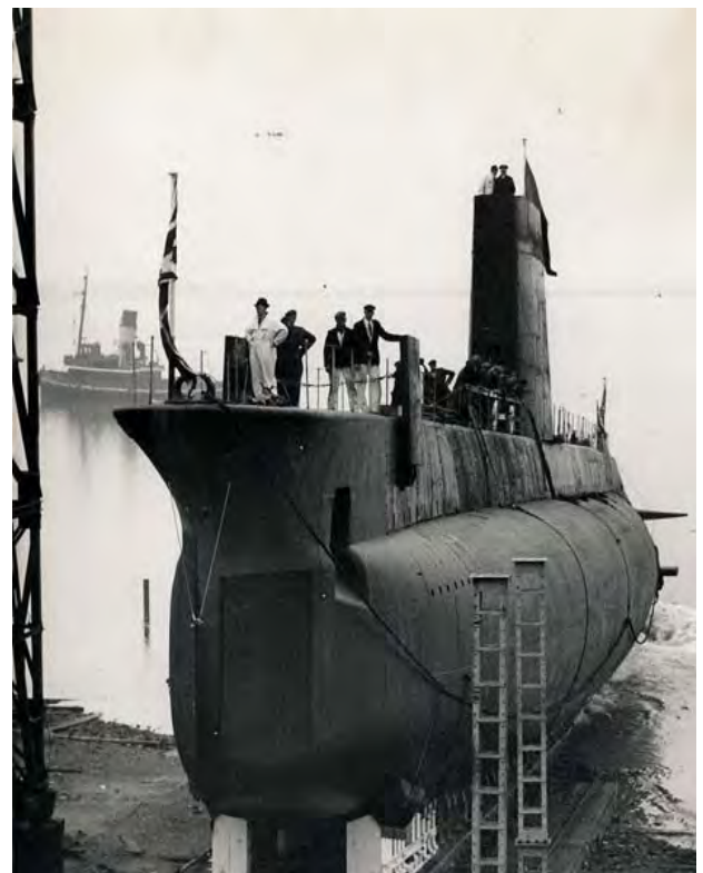
LAUNCH DAY: Porpoise seen at Barrow shipyard in 1956

The weaponry of the Porpoise class was updated in 1970 to operate the Mark 24 Tigerfish, a heavy acoustic homing torpedo.