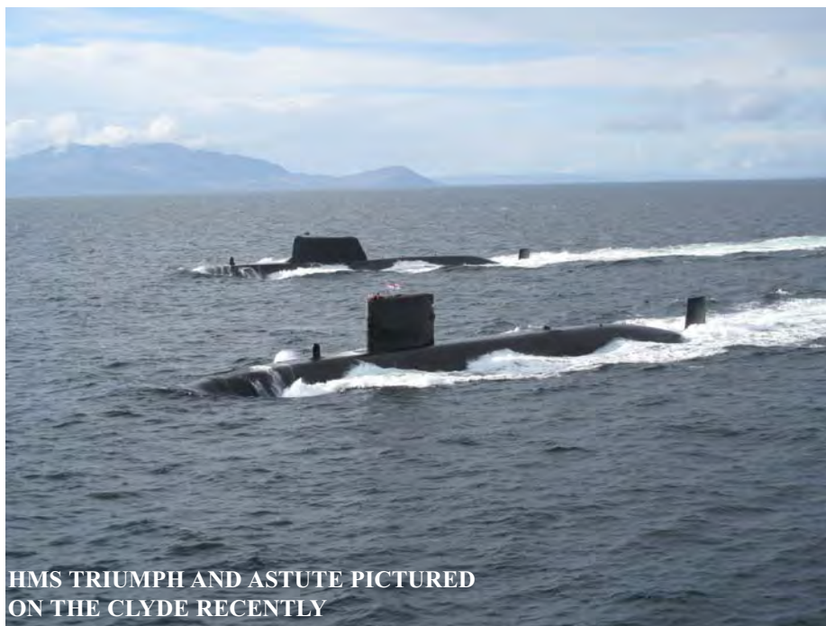
HMS TRIUMPH AND ASTUTE PICTURED ON THE CLYDE RECENTLY

Capability improvements have included installation of the latest sonar 2076 bow, flank and towed array systems, and upgrade for Tomahawk land attack cruise missile systems. A new command and control system has been installed, as well as a new internal fibre optic computer systems network and enhanced satellite communications system. An additional ballast pump has been installed to aid rapid deballasting, and a number of safety improvements incorporated to fire fighting and escape capabilities. Major equipments have been upgraded to support both efficiency and obsolescence management programmes, such as the chilled water plants.