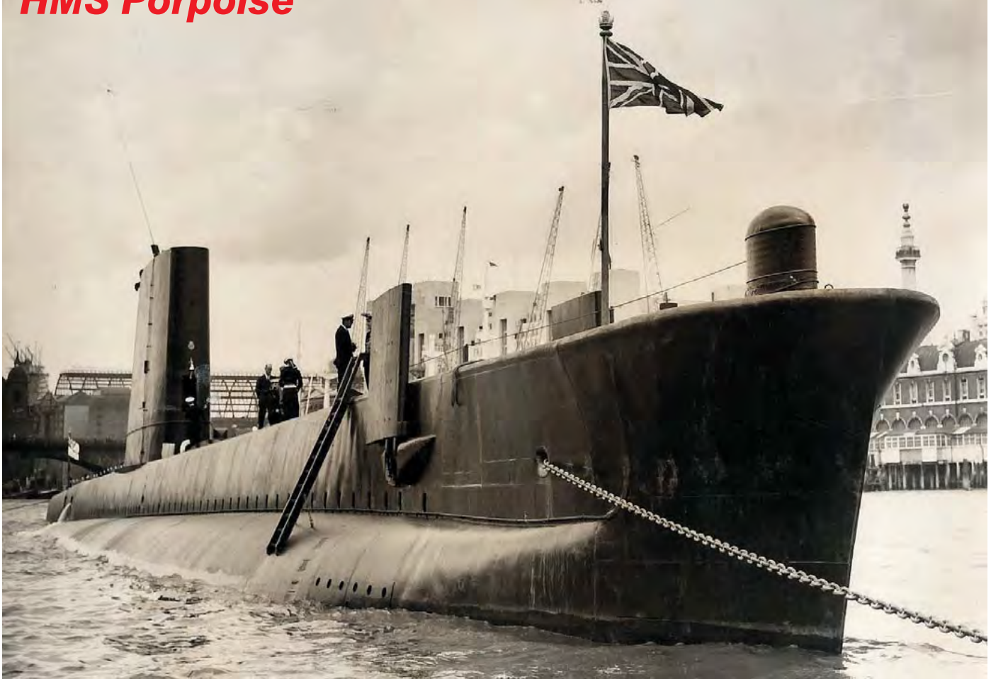
ON TOUR: HMS Porpoise in London for an official four-day visit in July 1958

H M S Porpoise (designated S01) was a Porpoise-class submarine of the Royal Navy.