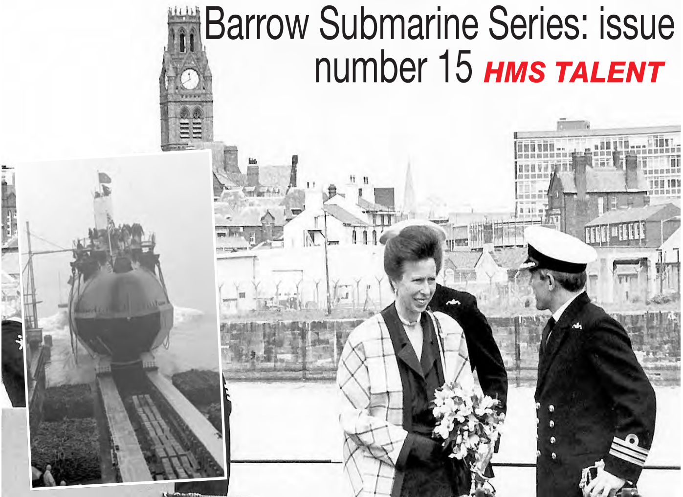
ROYAL VISIT: Princess Anne at the commissioning for HMS Talent on May 14 in 1990 and, inset, going down the slipway in 1988 as the last dynamic submarine launch at Barrow

H M S Talent was commissioned in 1990 by the Princess Royal as the sixth of seven Trafalgar class hunter killer submarines built at Barrow.