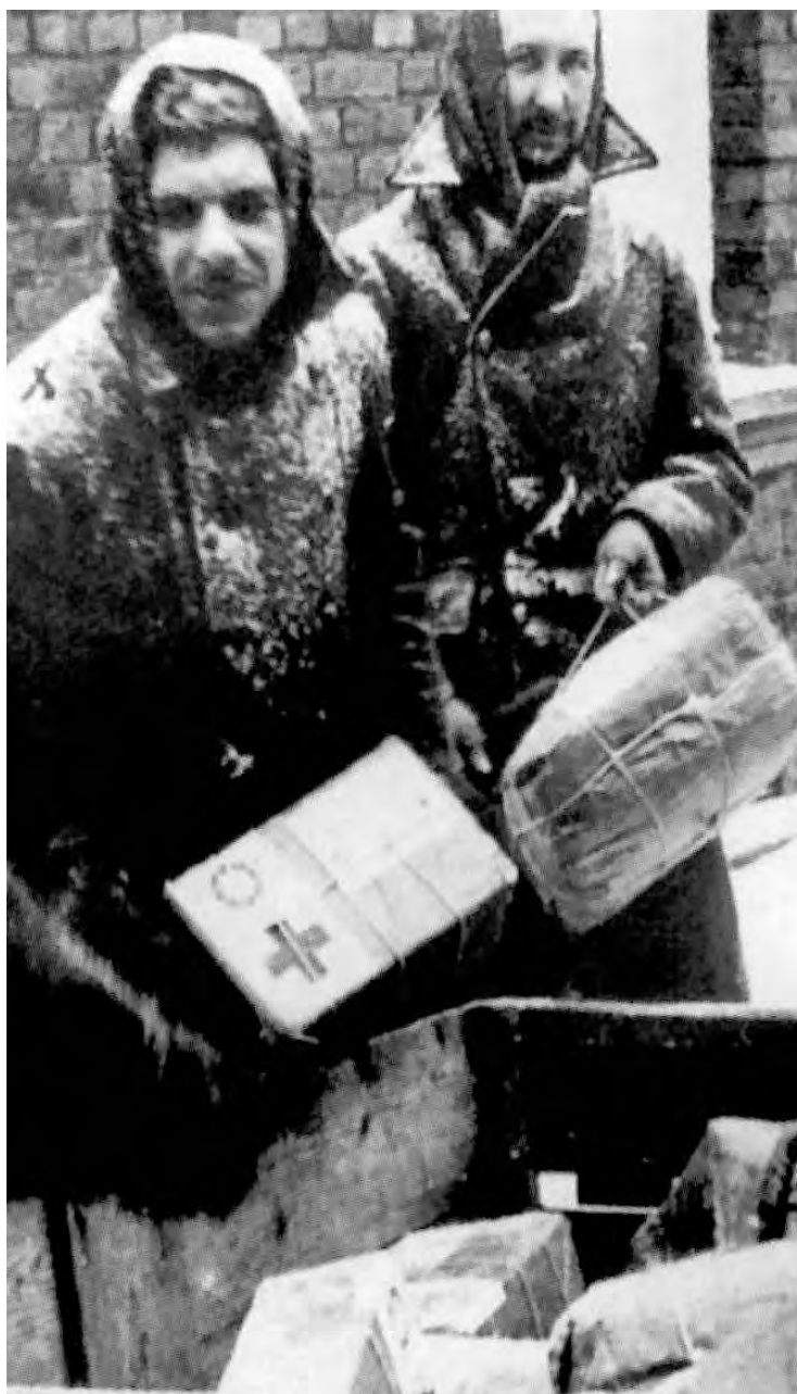
TOUGH TIMES: Prisoners from the Barrow-built HMS Undine imprisoned by Germany after their sub was depth-charged and lost