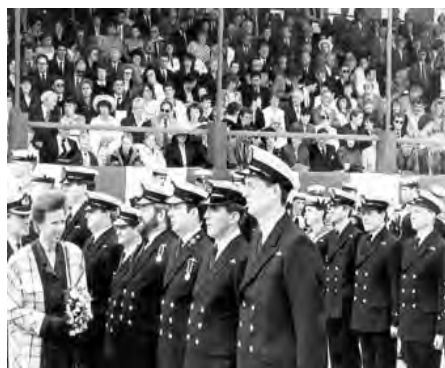
SPECIAL DAY: The Princess Royal inspects the crew of HMS Talent at the commissioning ceremony in May 1990

Ordered: 10 September 1984 Laid down: 13 May 1986 Launched: 15 April 1988 Sponsored by: The Princess Royal Commissioned: 12 May 1990 Homeport: Devonport, Plymouth Class and type: Trafalgar class submarine