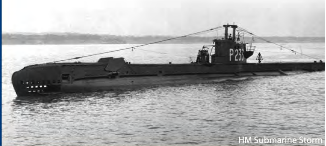
HM Submarine Storm