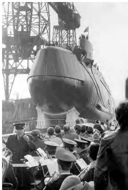
LAUNCH DAY: The traditional slipway send off for Repulse in 1967

The Evening Mail reported: “Long haired students chanting ‘we shall not be moved’ were dragged by the ankles to the roadside by policemen, mini-