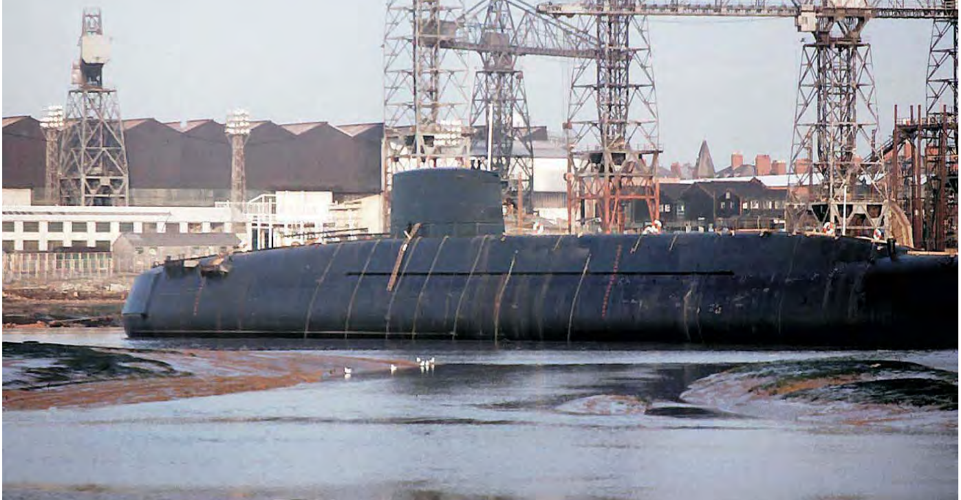
SHORT TRIP: HMS Repulse gets stuck in the sand at Barrow

H MS Repulse hit the headlines for all the wrong reasons on her launch day at Barrow on November 11 in 1967.