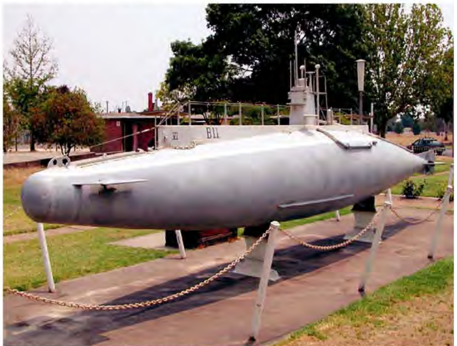
TRIBUTE: A scale model of HMS B11 at Holbrook, the Australian community named in honour of Norman Douglas Holbrook the submarine Victoria Cross hero

managed to capture the crew of an Austrian flying boat after the aircraft had suffered engine failure while returning from a bombing raid.