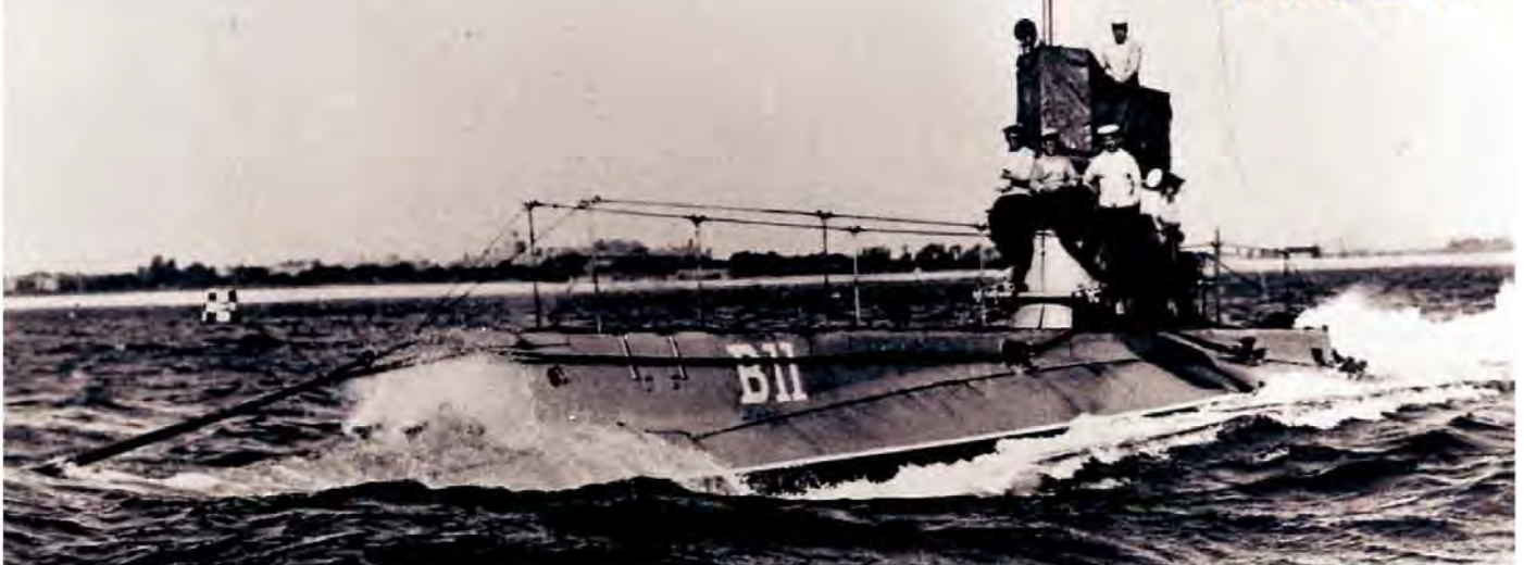
DARING MISSION: The Barrow-built HMS B11 launched an attack on a Turkish battleship in the First World War

HMS B11 was the last boat of the Royal Navy's B-class of submarines and was launched at Barrow on February 24 in 1906.