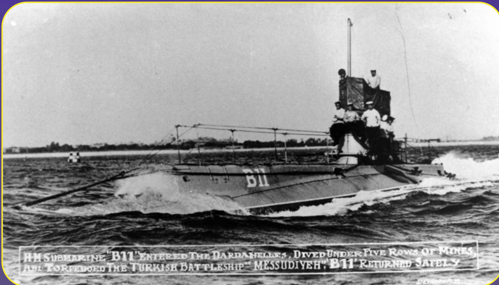
HMS SUBMARINE "B11" ENTERED THE DARDANELLES, DIVED UNDER FIVE ROWS OF MINES AND FORGED THE TURKISH BATTLESHIP "MESSUDIEH", B11 RETURNED SAFELY

Submariners Association ▪ Barrow-in-Furness Branch Newsletter ▪ Issue 143