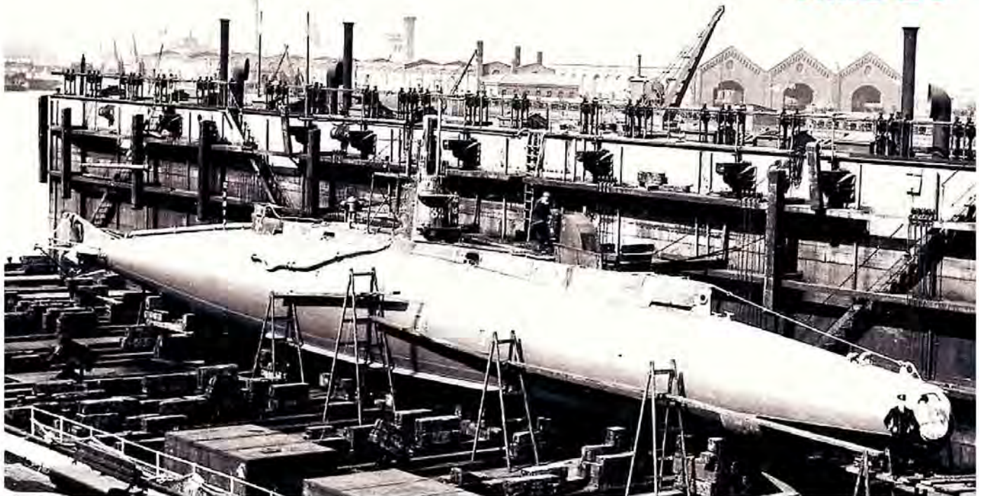
TAKING SHAPE: The Barrow-built HMS B8 took part in the First World War

T HE Barrow submarine HMS B8 was completed for the Royal Navy in April 1906 and shortly after the outbreak of the First World War was deployed to the Mediterranean.