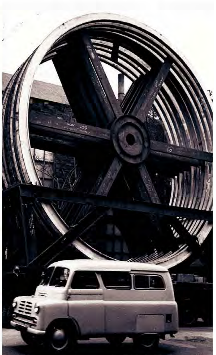
CLUES: This shows the pressure hull frames on the Barrow-built submarine Valiant which was launched in December 1963. See if you can find the 12 words linked to submarines we have hidden in the wordsquare