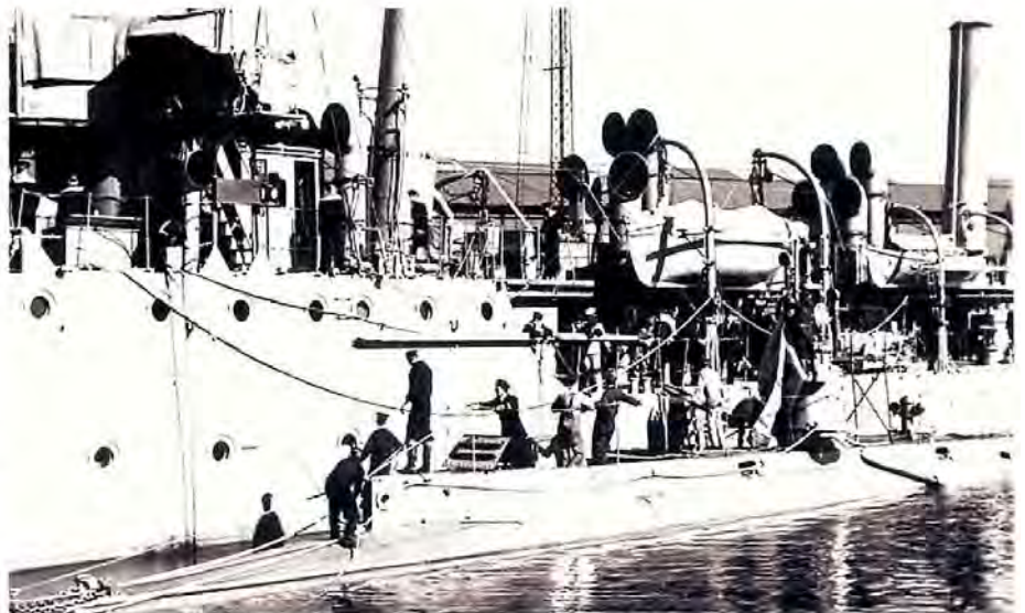
LOADING UP: HMS B8 never strayed too far from the support of its depot ship

Here he took command of B8 , which was working from the submarine depot