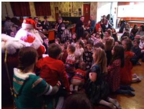
Santa has arrived in the Building!