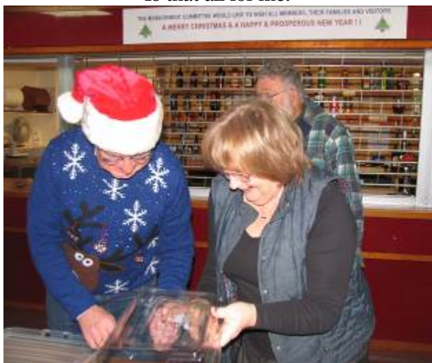
Some of Santa's Bigger Helpers!