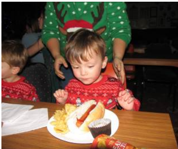
Is that all for me?