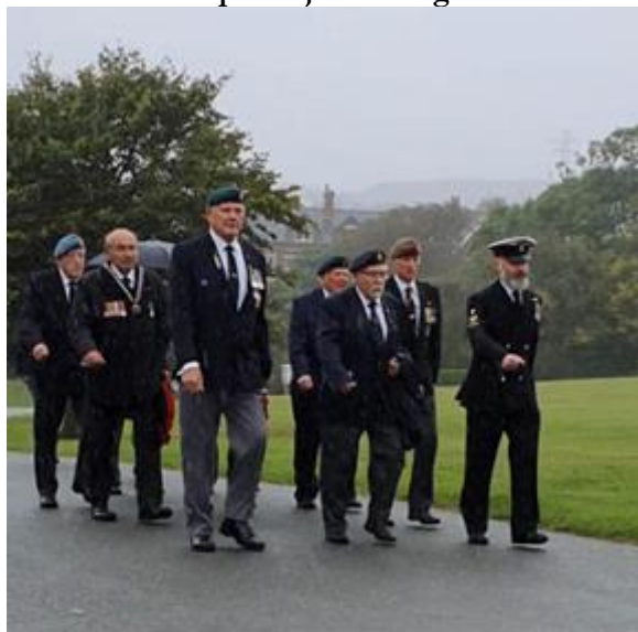
The Veterans Platoon

At the Cenotaph it started to rain – but that was not on the Order of Service and the rain continued for the whole of the Service – which went as usual and was followed by the Laying of Wreaths.