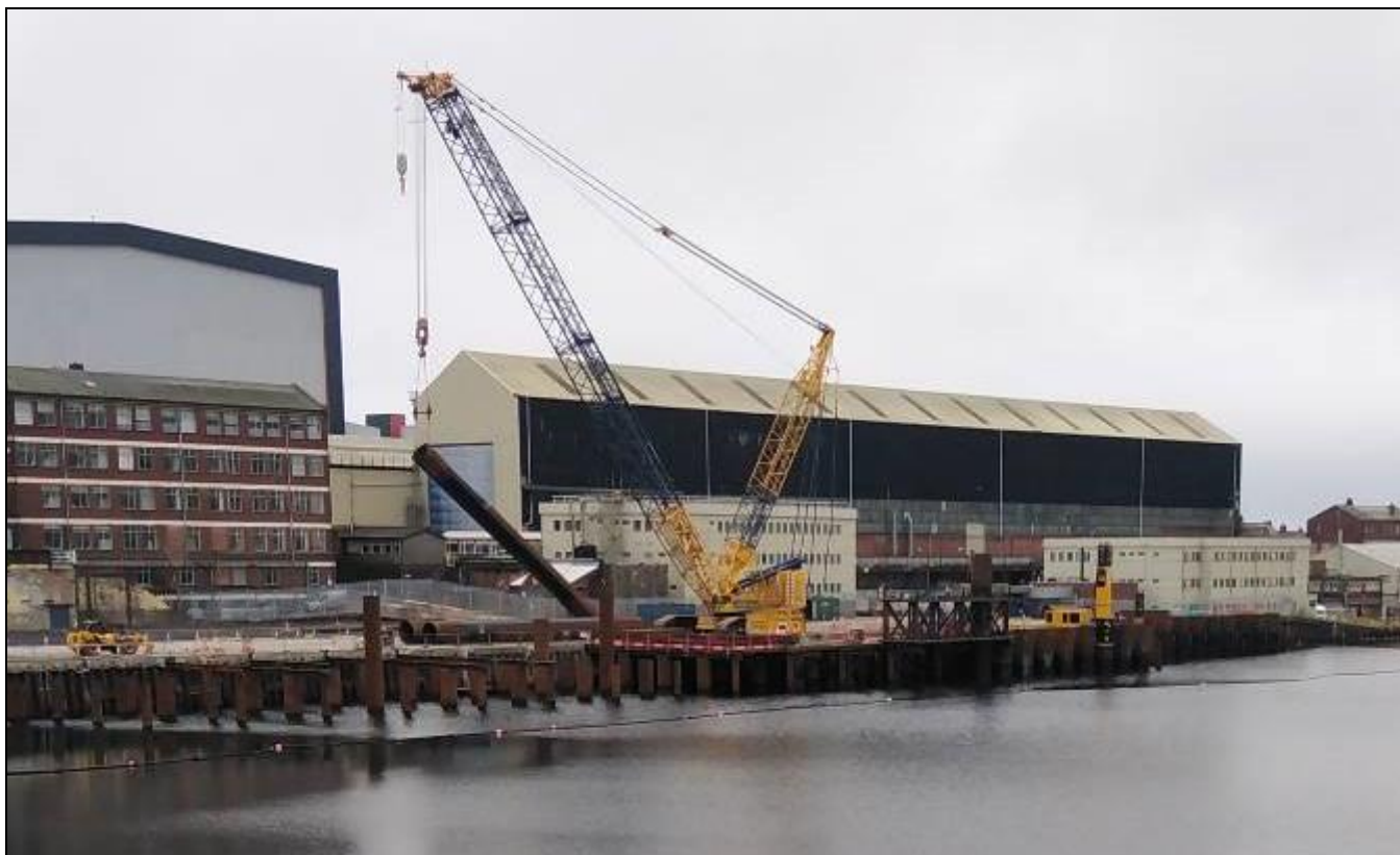
Lifting one of the Piles before placing in position before driving into the floor of Devonshire Dock