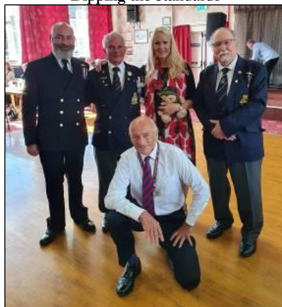
At the Legion