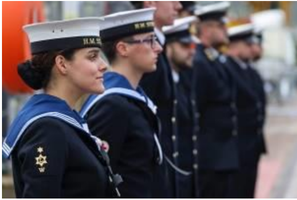
Proud crew members from HMS AUDACIOUS, the fourth of the Astute-Class submarines.