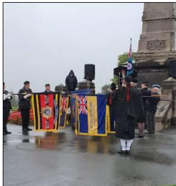
Dipping the Standards

On completion the Parade marched back down the hill and fell out at the Gates. Everyone then made their own way to the Legion for the usual Social event and Pie & Peas.