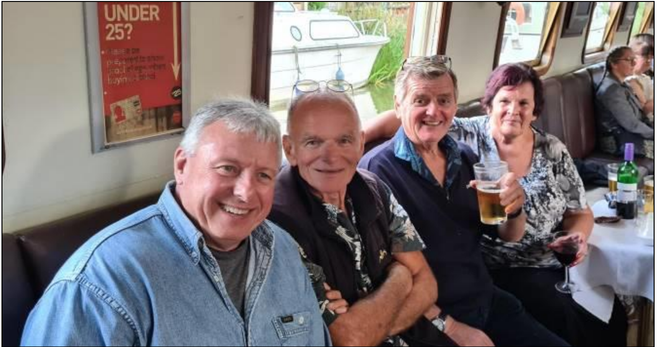
And Some More!