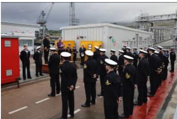
The ceremonial commissioning at Faslane.

Sent by: Royal Navy Communications & Influence, Regional Press Office (Scotland & Northern Ireland), HM Naval Base Clyde.