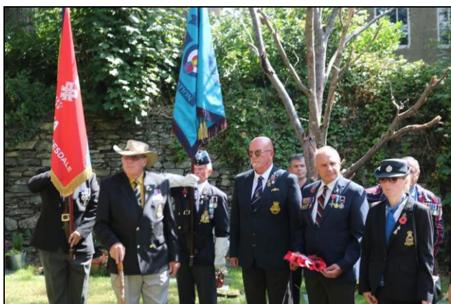
The Service and Wreath Laying