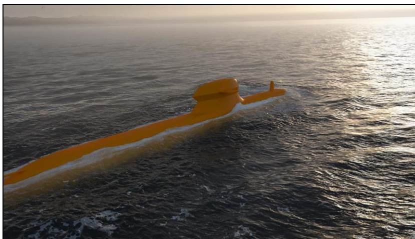
The C718 is an advanced Expeditionary Submarine that offers endurance.

With the support of Sweden and the United Kingdom, SAAB has presented a proposal to the Netherlands to replace their existing submarines.