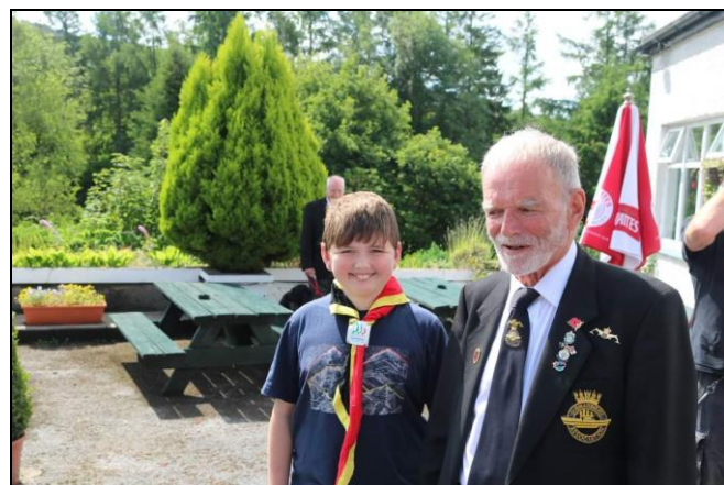
Grandad and Grandson