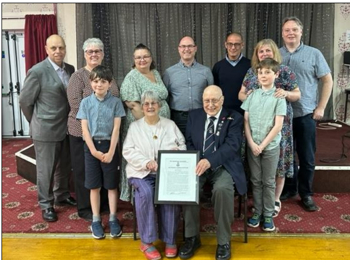
The Downer Family Photo (with the Commendation)

Unfortunately we are unable to attend the August Branch Meeting where we had hoped to be able to thank Branch Members in person but, hopefully we will be at the September Meeting when we can catch up with everyone.