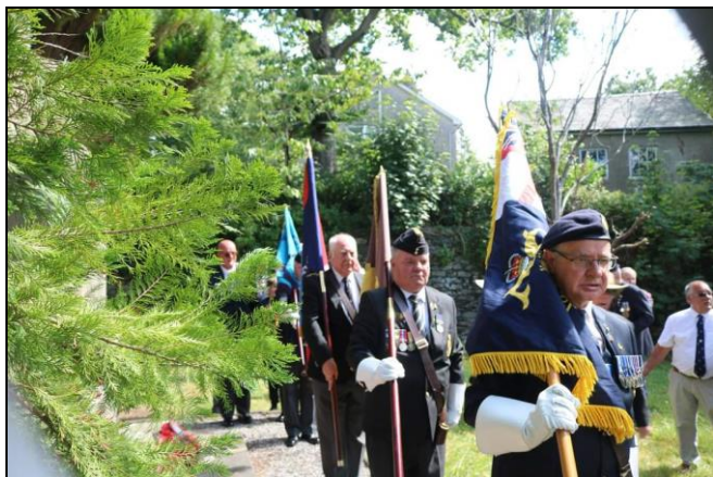
March on the Standards