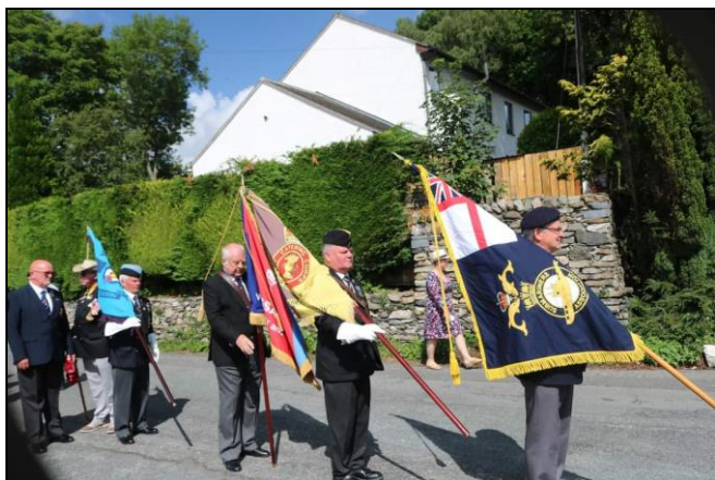
The Standard Bearers