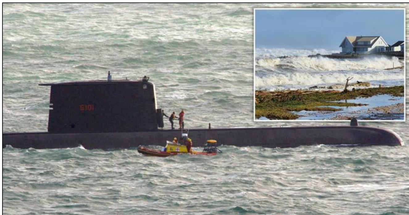
South African Submarine MANTHATISI