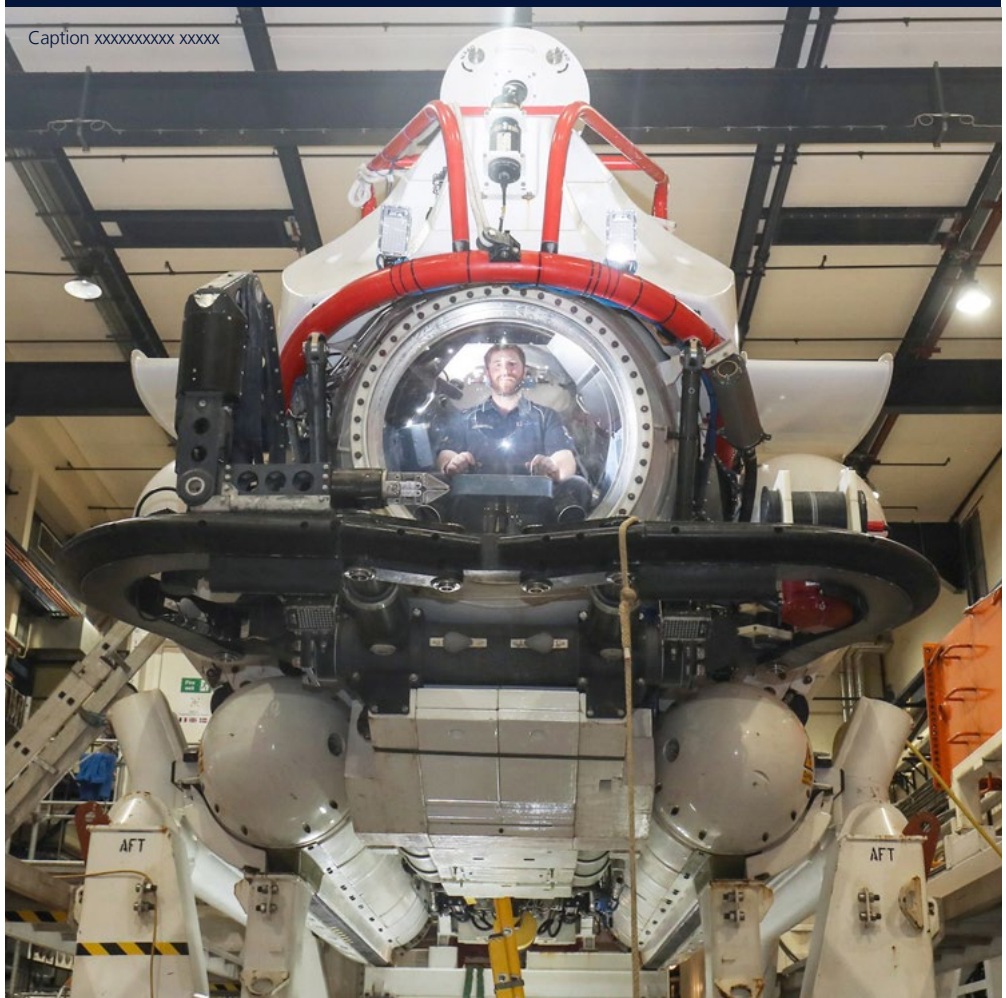
Caption xxxxxxxxxxx xxxxx

Also attending were Medical Officers from the US Navy who observed the scenario-led training with the aim of developing relationships and sharing knowledge.