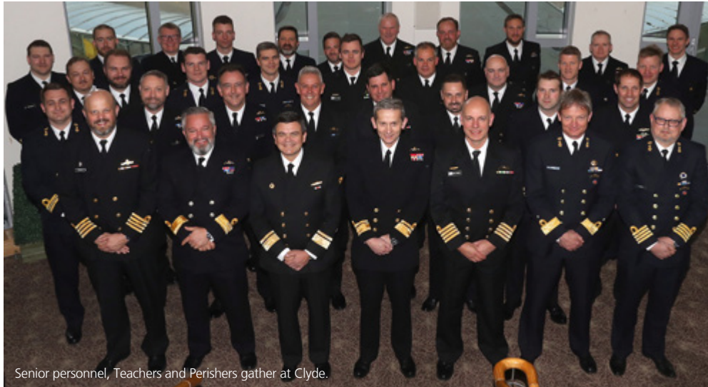
Senior personnel, Teachers and Perishers gather at Clyde.