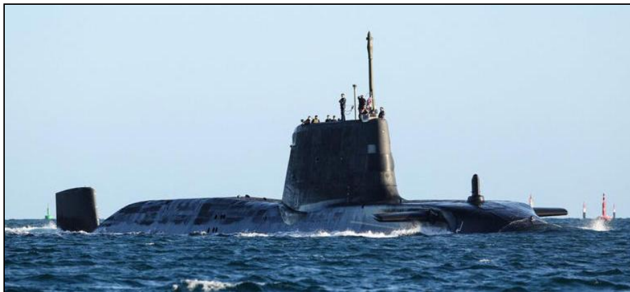
HMS ANSON is positioned in the Arabian Sea

The above image, taken and released by the United Kingdom's Ministry of Defence on February 22, 2026, shows the HMS ANSON submarine in transit to HMAS STIRLING – the Royal Australian Navy base in Western Australia.