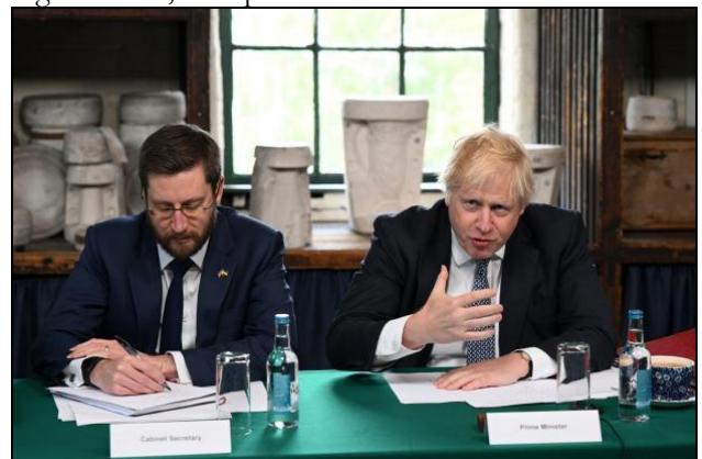
Lord Simon Case (left), chair of Team Barrow's Delivery Board, seen here as cabinet secretary next to Boris Johnson

Michelle Scrogam, MP for Barrow and Furness, a member of the Defence Committee, reiterated much of the language that is seen throughout the published document. In relation to Barrow, Mrs Scrogam said the report highlights "the scale and urgency of the task ahead and the need for additional funding to provide the necessary improvements in housing, healthcare, town regeneration, transport and education."