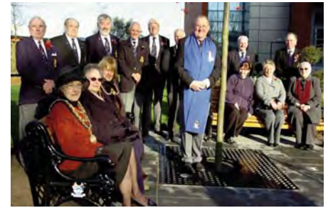
The Dedication Ceremony