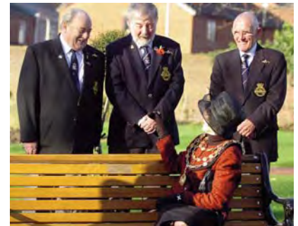
Chatting to the Mayor

In the end only five from the Derby Branch managed to visit Barrow 13th to 15th November in response to their invitation by HMS AMBUSH (Derby is their adoptive town!) to have a look at the Yard and how AMBUSH is progressing.