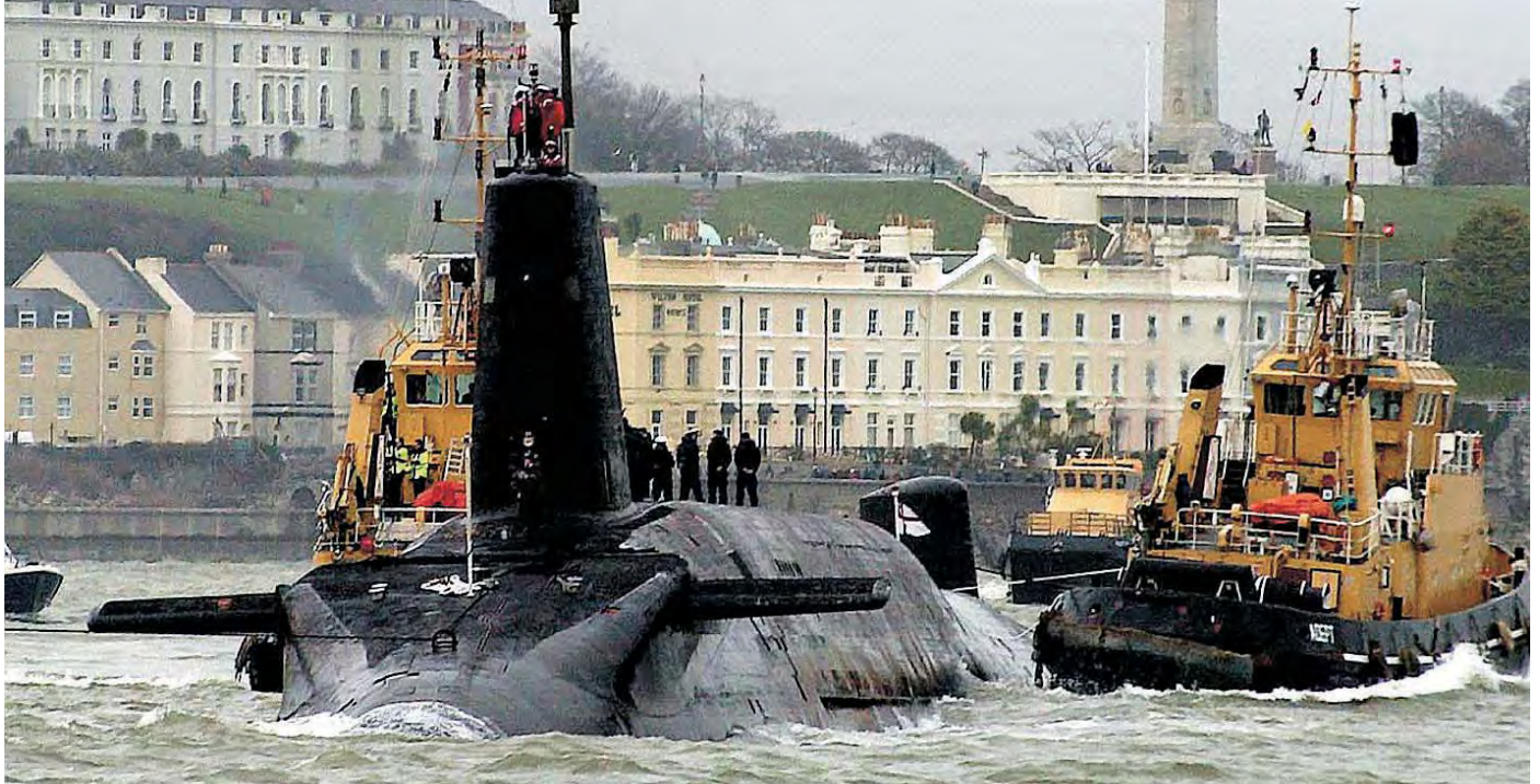
JOURNEY'S END: The Royal Navy nuclear submarine HMS Vanguard arrives at Devonport naval base in Plymouth for a refit in February, 2002

H M S Vanguard (S28) is the 10th vessel of the Royal Navy to bear the name and is the lead boat of her class of Trident ballistic missile-armed submarines.