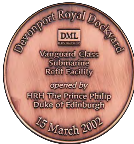
SOUVENIR: A bronze medal for the Vanguard-class submarine refit facility dated 2002

On the night between February 3 and 4 in 2009 Vanguard and the French nuclear submarine Triomphant