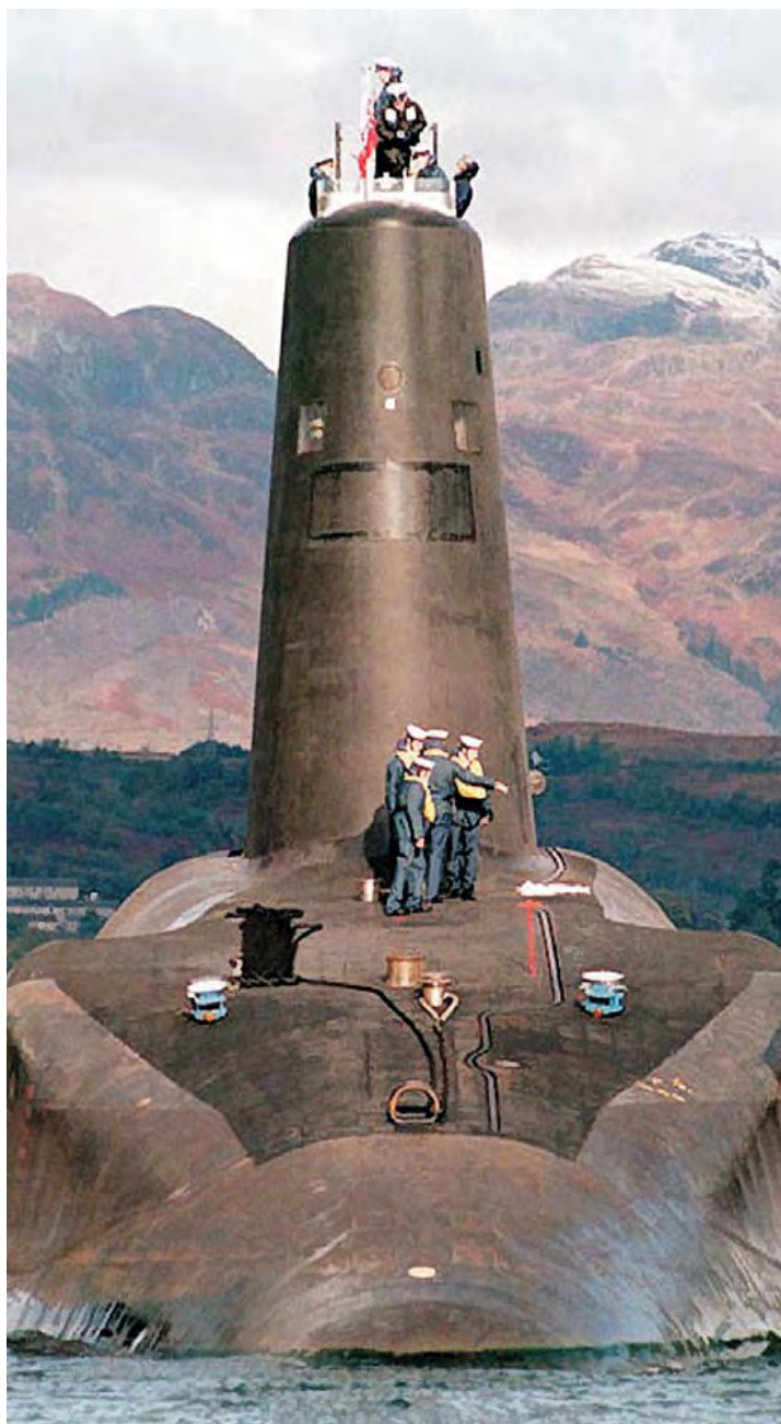
READY FOR REFIT: The Trident-class nuclear submarine HMS Vanguard seen in 2002 on the way to Plymouth for a refit