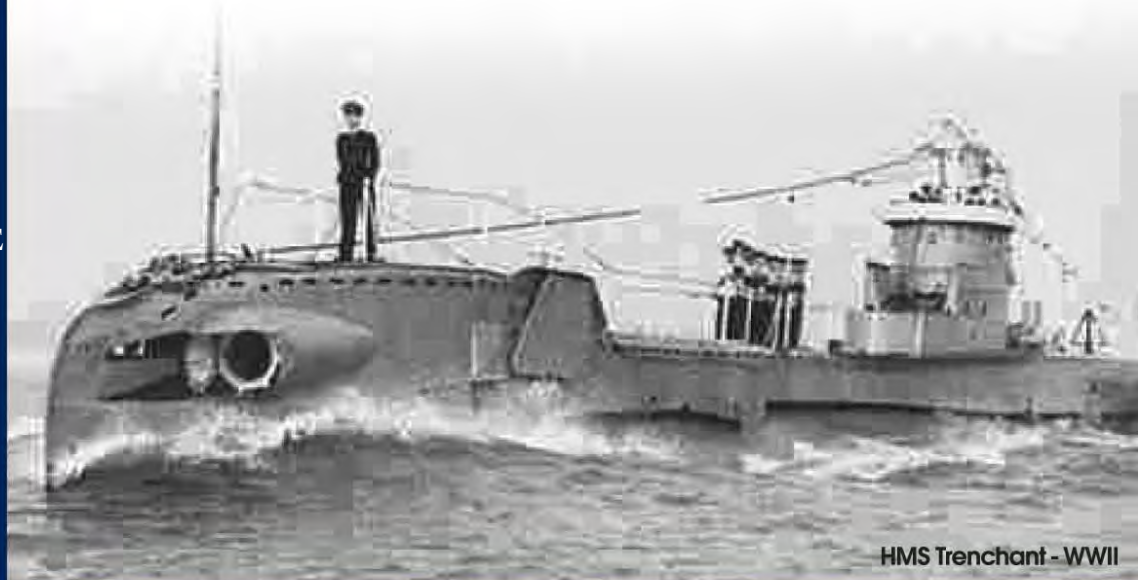
HMS Trenchant - WWII