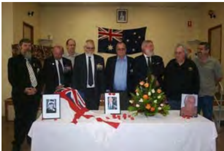
Members attending memorial service in Australia