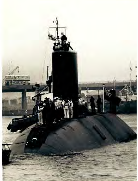
HOME AGAIN: Turbulent arrives back in Barrow after sea trials off the Scottish coast

Displacement: Surfaced: 4,740 tons. Dived: 5,208 tons Length: 280.1 ft (85.4 m) Beam: 32.1 ft (9.8 m) Draught: 31.2 ft (9.5 m) Propulsion: 1 x Rolls Royce PWR1 nuclear reactor Speed: Dived: 32 knots (59 km/h)