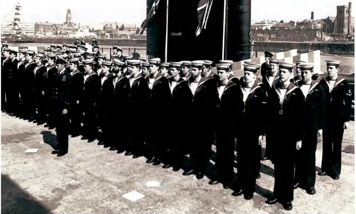
ON PARADE: The commissioning ceremony at Barrow for HMS Turbulent in 1984

HMS Turbulent is a Trafalgar-class nuclear submarine launched at Barrow in December 1982.