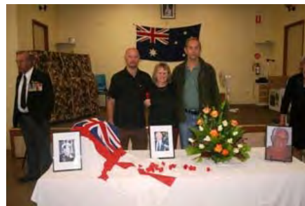
Members of the Family