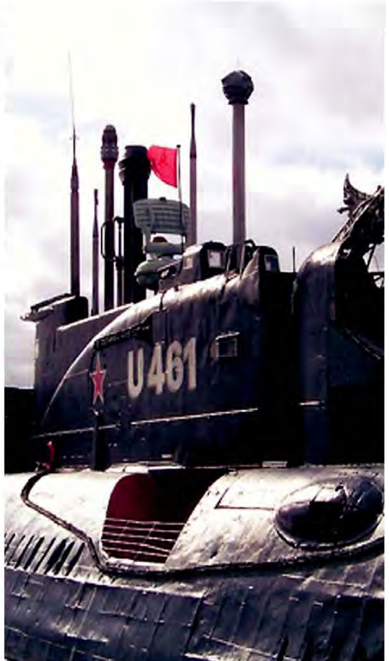
FRIEND OR FOE? The Russian submarine Juliett . Can you find its name in the wordsquare?