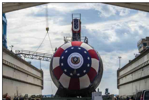
Virginia-class attack submarine Pre-commissioning unit (PCU) John Warner (SSN 785) on Sept. 1, 2014.

the design research community needs to take action now.”